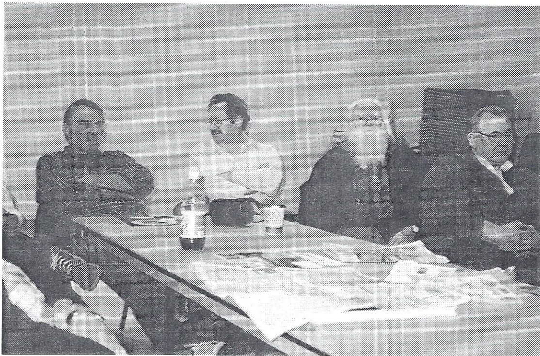
Our Nov. 99 meeting