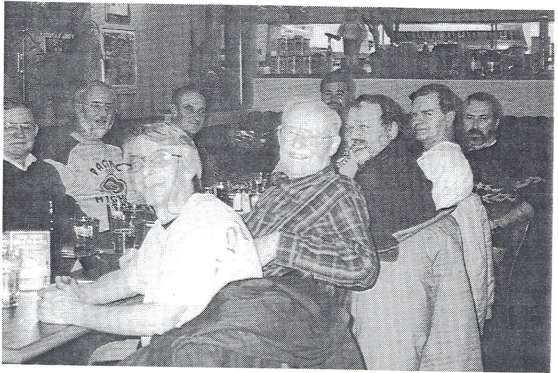
Xmas 99 pizza night at Boston Pizza