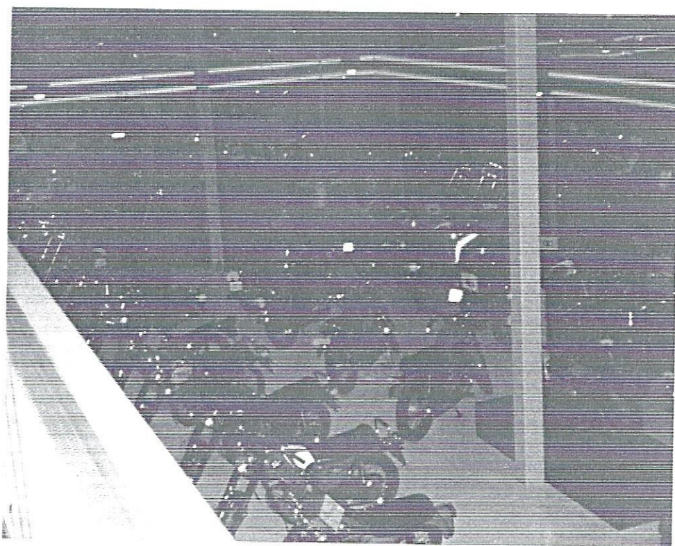
Right, a view down from one of the three sections of the mezzanine, in the museum