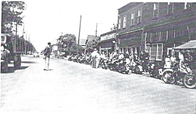
LEFT, NORTH WEST CYCLE & MOTOR CO. LOGAN AVE. WINNIPEG 1946-47 ( 3 )