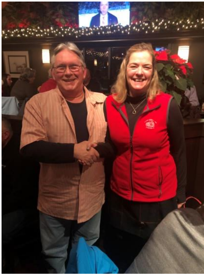
Handing over the reins.

Well the annual Christmas get together was another success. About fifty members and guests attended.