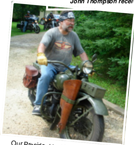
Our President looking very Vintage!