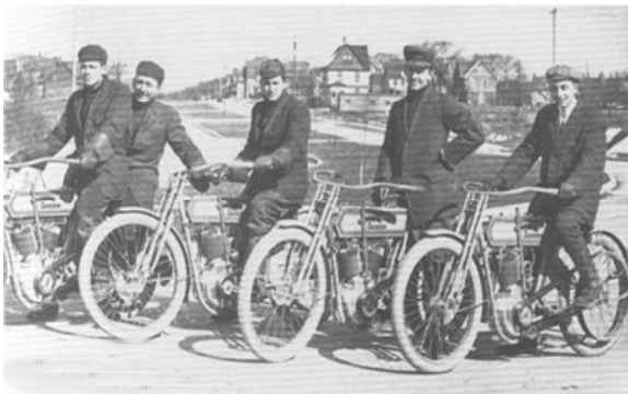
Group of rides circa 1912