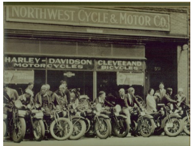
Northwest Cycle 1930's

After a period of time he bought out the Royal Bank building at 551 Logan Ave. In the mid-20s Northwest Cycle became an official Harley-Davidson agency. The bulk of their sales were made up primarily of Harley-Davidson and Henderson Motorcycles.