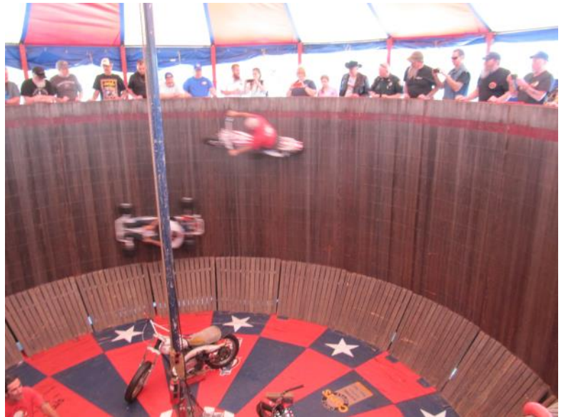
67 years old rider preparing to ride the Wall of Death Indian still the first choice for wall of death riders.