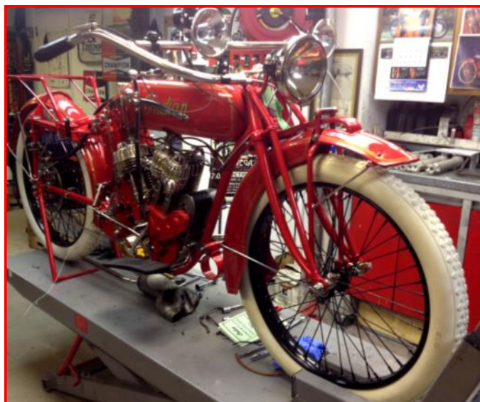
In the garage!

Membership dues are $25/ yr includes a bi-monthly newsletter and a host of other benefits!