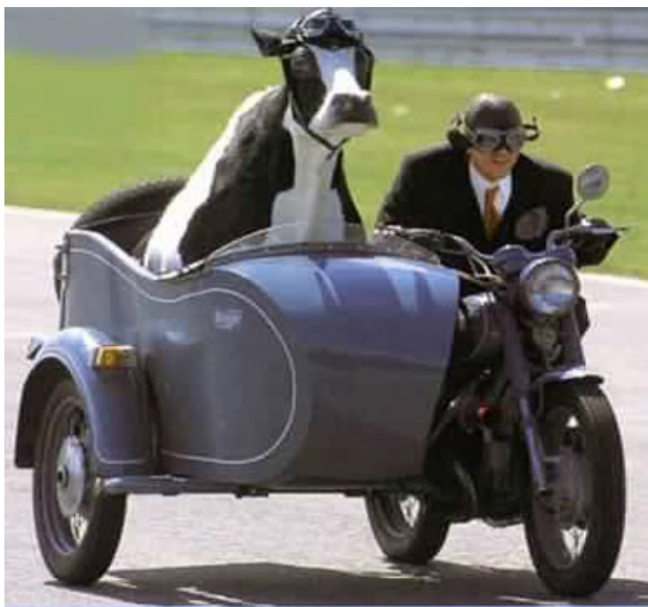
Motorcycle must be a "Cowasaki"