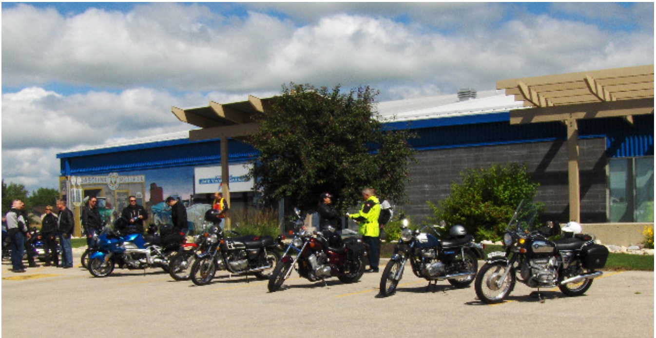
The group rallying up to go to Ft la Reine