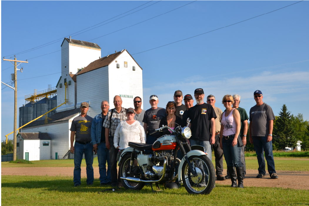
Members of AMCM and CVMG chapter enjoying a weekend camping Makinak, MB