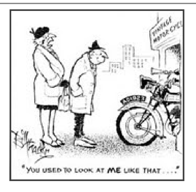
"You used to look at ME like that"

AUGUST 3—4<sup>th</sup> CVMG Biggar Rally—Biggar, SK*