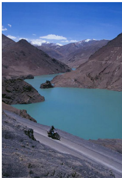
What a ride!