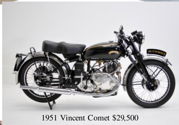
1951 Vincent Comet $29,500