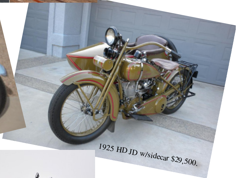
1925 HD JD w/sidecar $29,500.