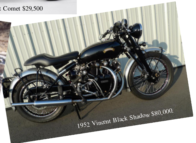
1952 Vincent Black Shadow $80,000.