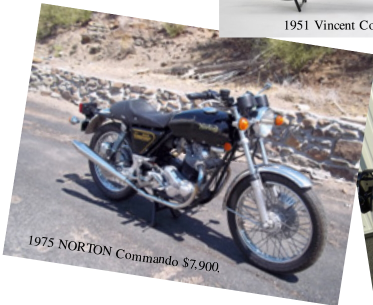
1975 NORTON Commando $7,900.