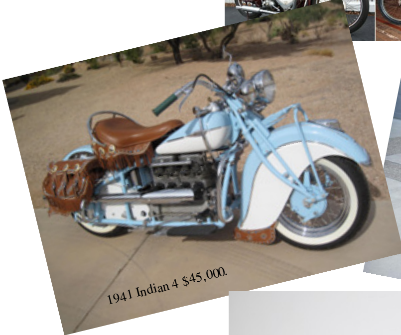
1941 Indian 4 $45,000.