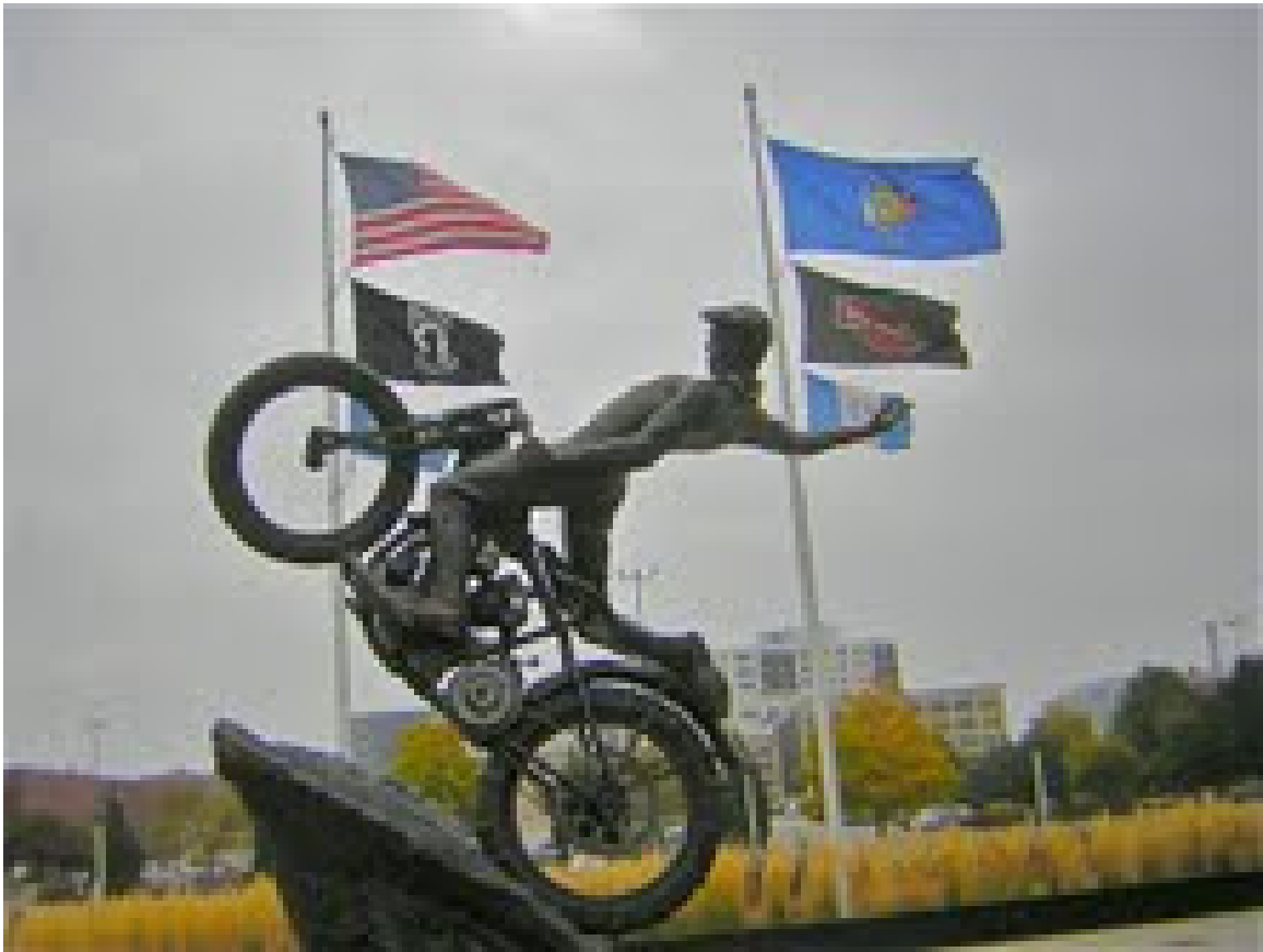
Harley Davidson Museum, Milwaukee, WI