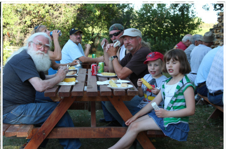
Who was the oldest member there?